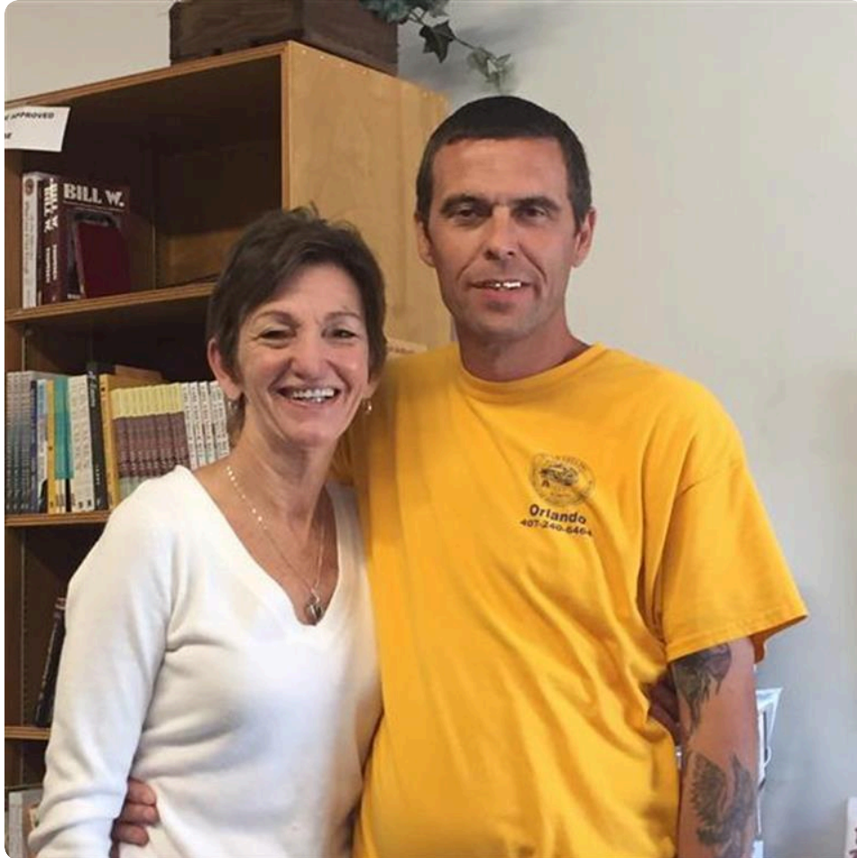
He always dropped by my work when he could...